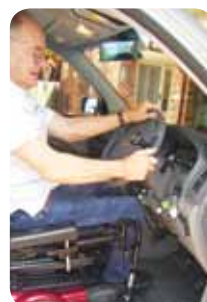
Tony South in his "wheel-in and drive" vehicle

The range of modifications and the related costs are vast. The average cost of modifying a station wagon which is good for wheelchair storage, for a paraplegic starts at around $4,000. This would include specially fitted hand controls, a spinner knob and appropriate mats and protection for the car. The vehicle must be automatic. Driving lessons and driver assessment are additional.